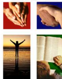
Living In Faith Everyday